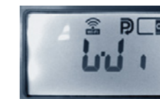
Wi-fi cloud connection